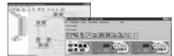
PolyView and CeraView screens

PolyView™ is Ceragon's NMS that includes CeraMap™, its friendly yet powerful graphical interface. PolyView can be used to update and monitor network topology status, provide statistical and inventory reports, define end-to-end traffic trails, download software, and configure elements in the network. In addition, it can integrate with Northbound NMS platforms, to provide enhanced network management.